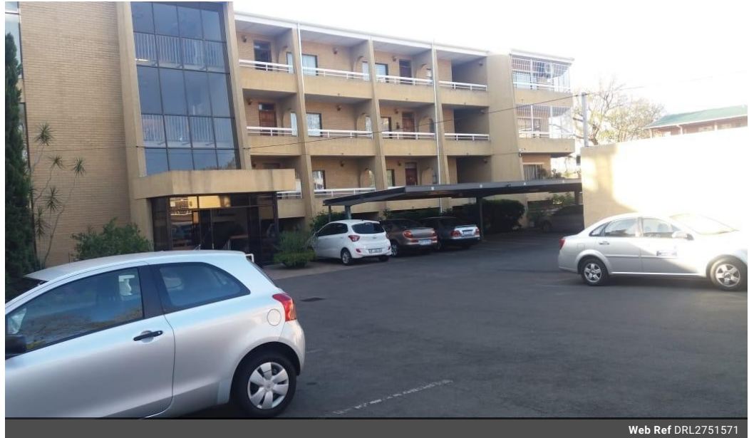
Web Ref DRL2751571

Shop 6 Mayors Walk Centre, 86 Mayors Walk, Prestbury, Pietermaritzburg, 3208