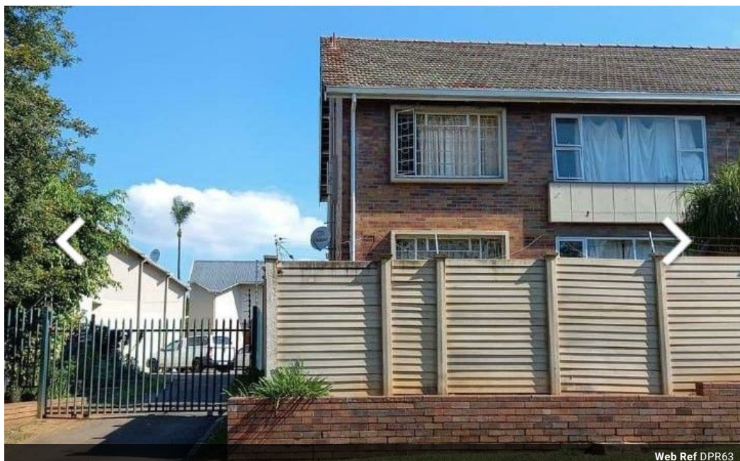
Web Ref DPR63

Shop 6 Mayors Walk Centre, 86 Mayors Walk, Prestbury, Pietermaritzburg, 3208