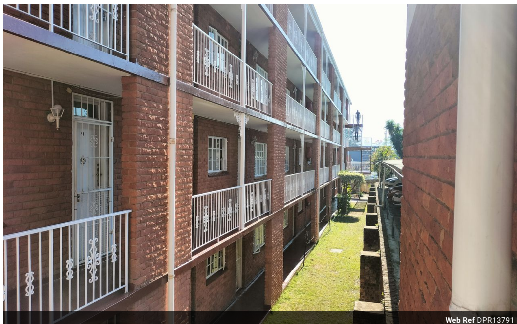
Web Ref DPR13791

Shop 6 Mayors Walk Centre, 86 Mayors Walk, Prestbury, Pietermaritzburg, 3208