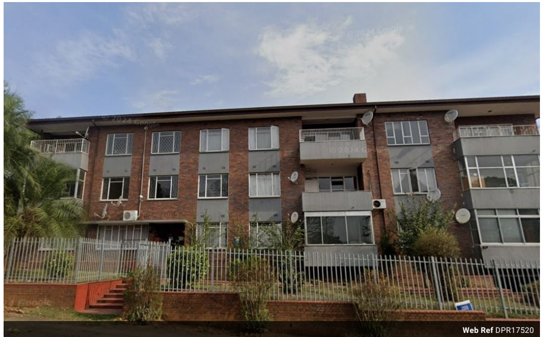
Web Ref DPR17520

Shop 6 Mayors Walk Centre, 86 Mayors Walk, Prestbury, Pietermaritzburg, 3208