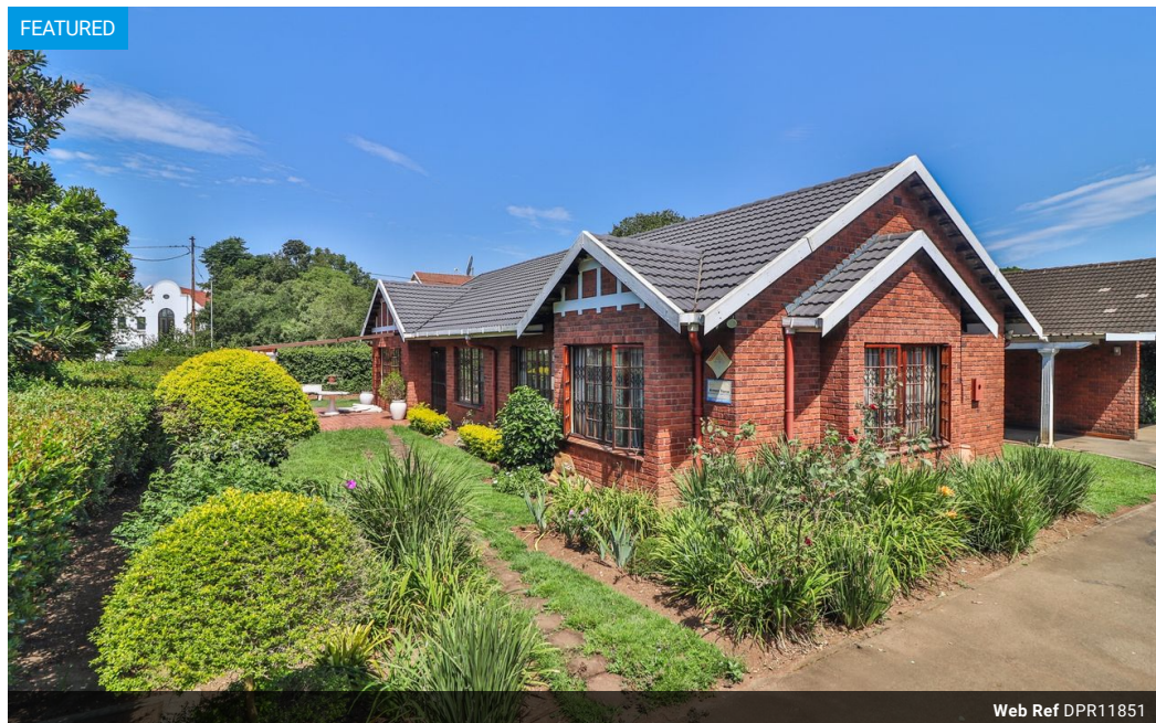
Web Ref DPR11851