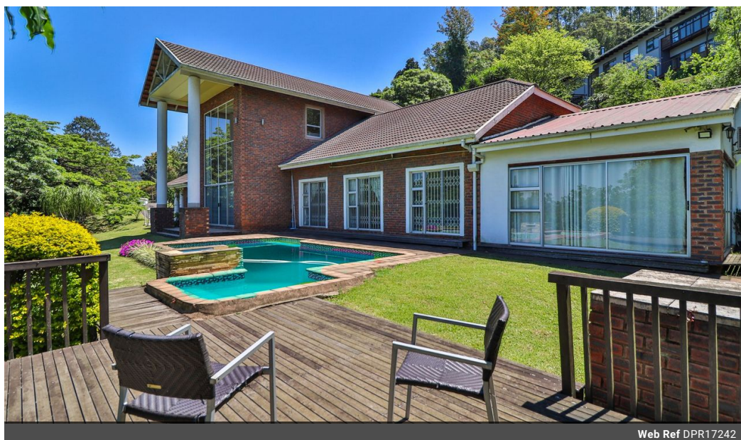
Web Ref DPR17242

Shop 6 Mayors Walk Centre, 86 Mayors Walk, Prestbury, Pietermaritzburg, 3208