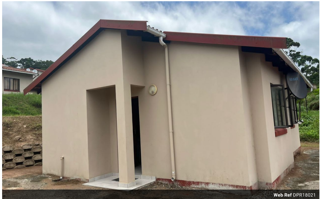
Web Ref DPR18021

558 Mountbatten Drive Reservoir Hills Durban 4090