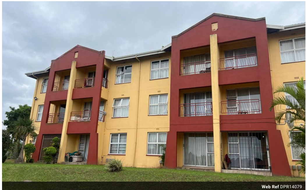
Web Ref DPR14079