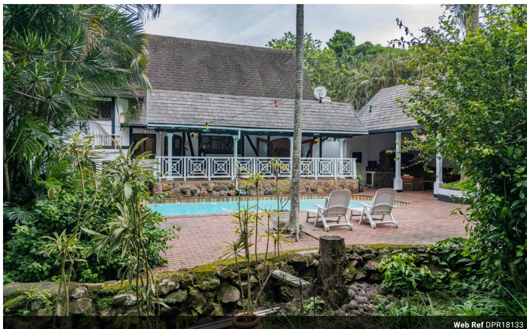
Web Ref DPR18133

Shop 1, Gordana Court, 22/26 Salisbury Avenue, Westville