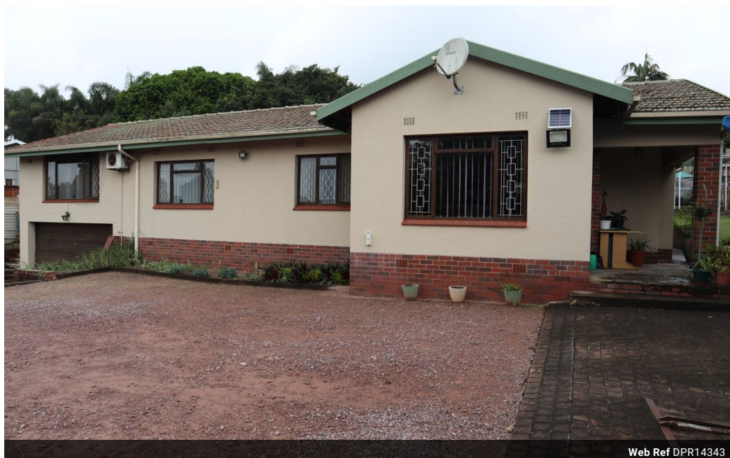
Web Ref DPR14343