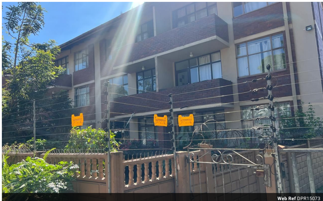
Web Ref DPR15073