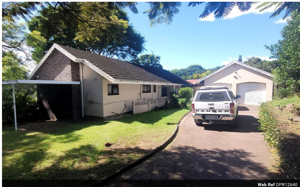
Web Ref DPR12640