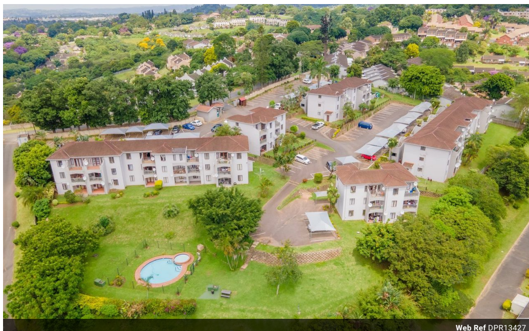
Web Ref DPR13427