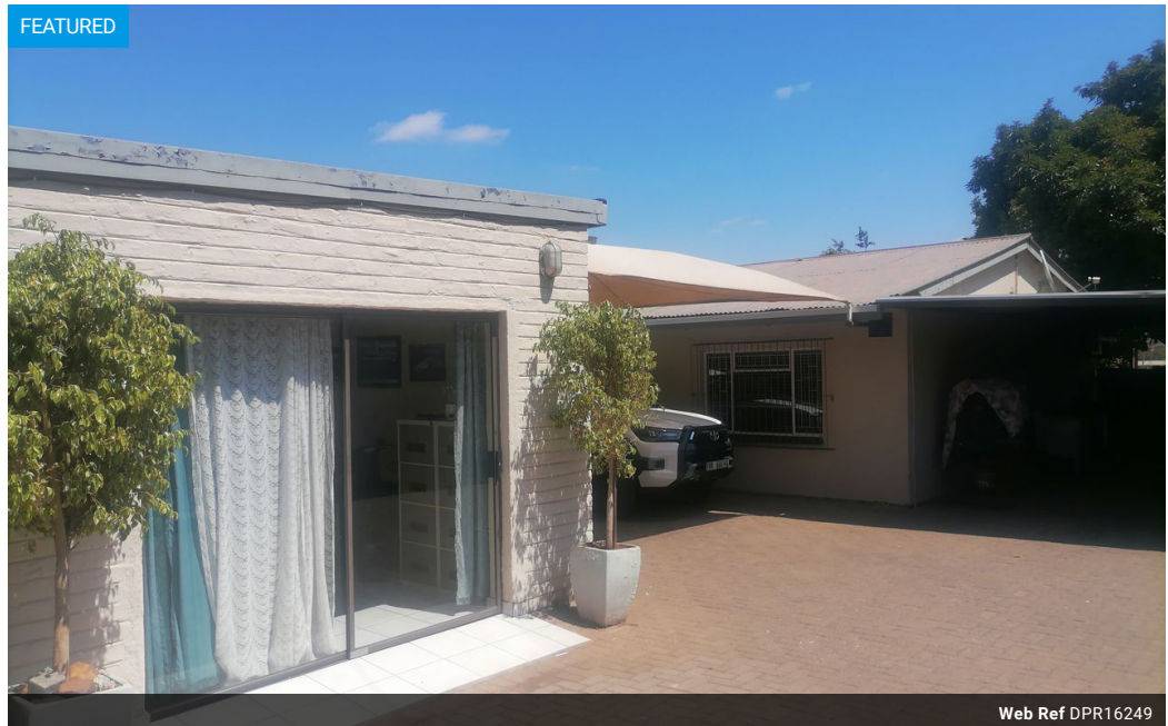
Web Ref DPR16249