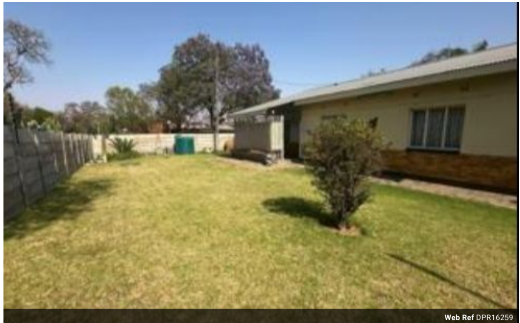
Web Ref DPR16259