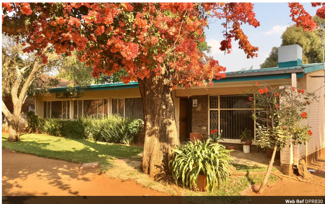
Web Ref DPR830