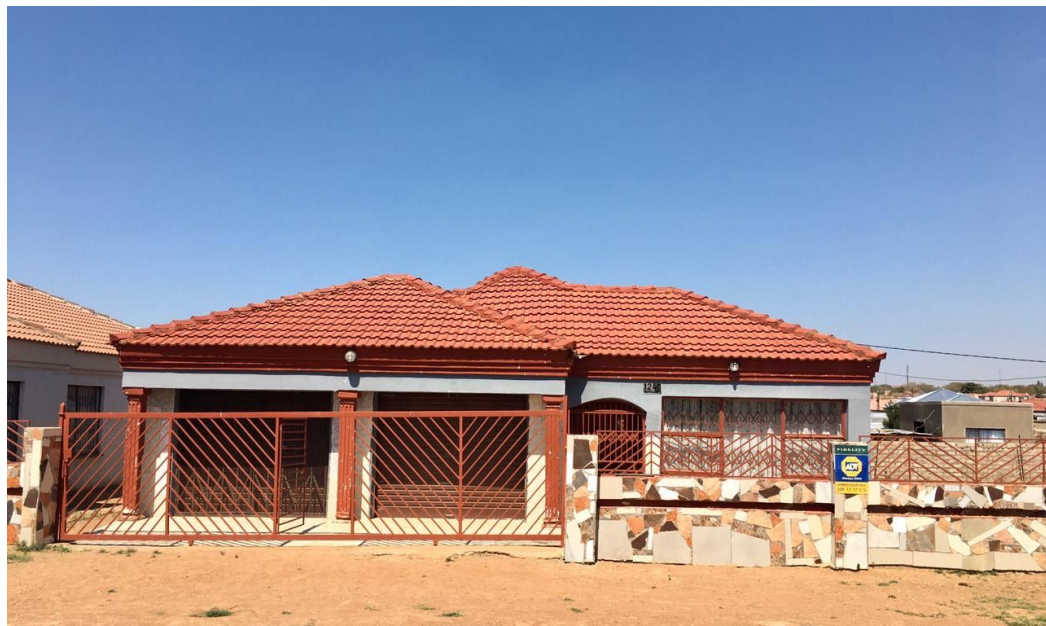
Web Ref DPR5978