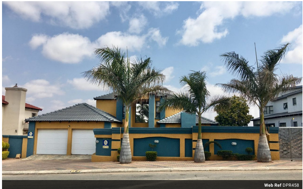
Web Ref DPR458