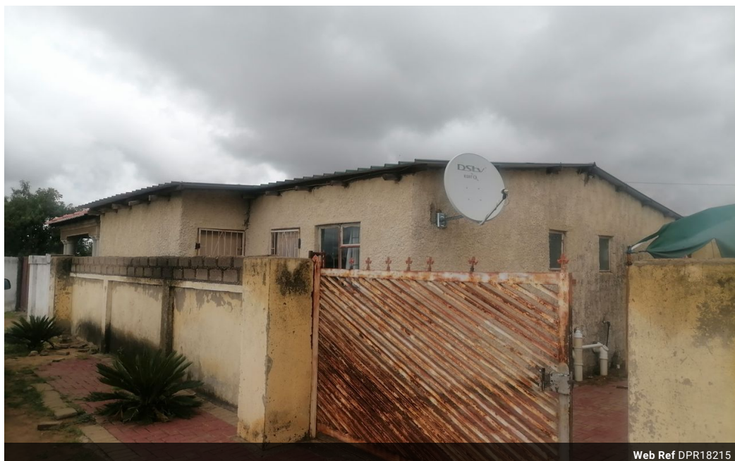
Web Ref DPR18215