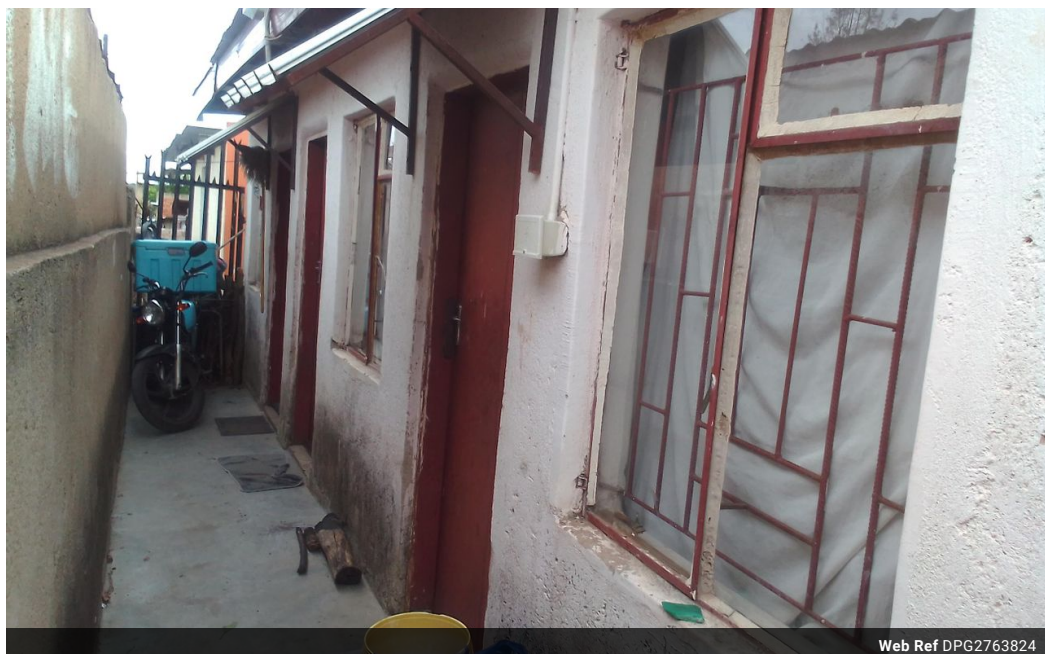
Web Ref DPG2763824