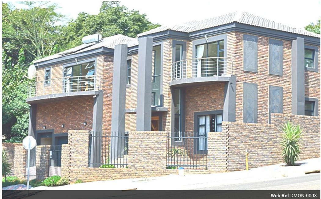
Web Ref DMON-0008