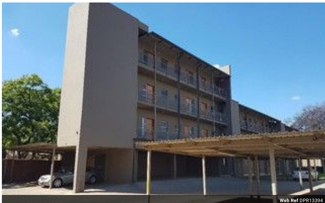
Web Ref DPR13394