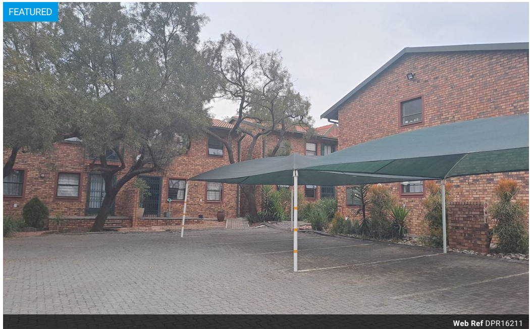
Web Ref DPR16211