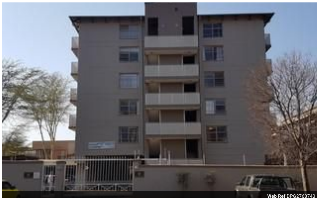
Web Ref DPG2763743