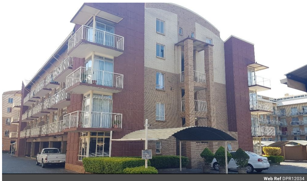
Web Ref DPR12034