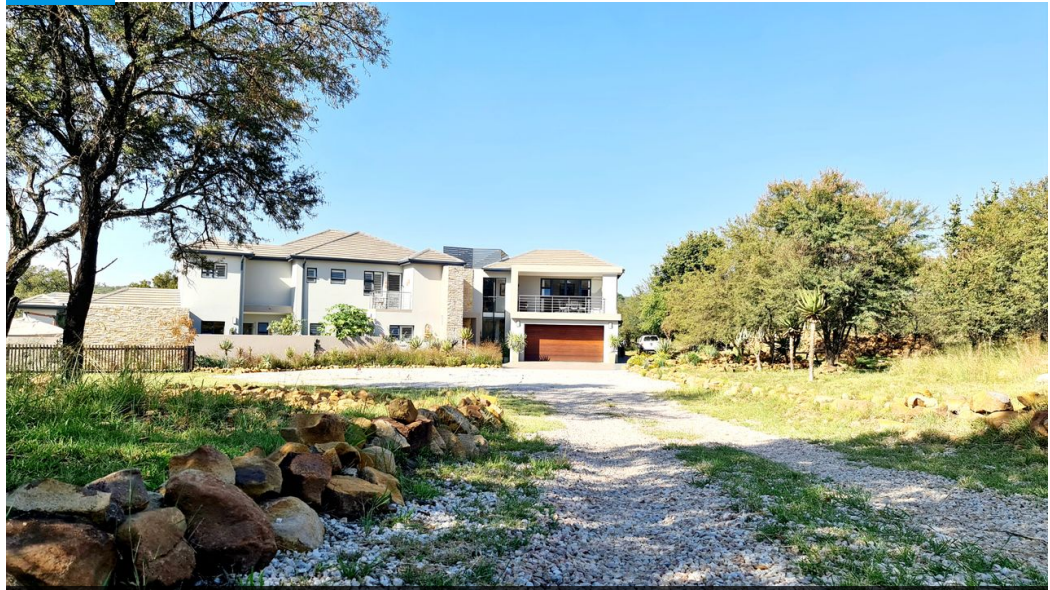
ON SHOW, SOLE MANDATE