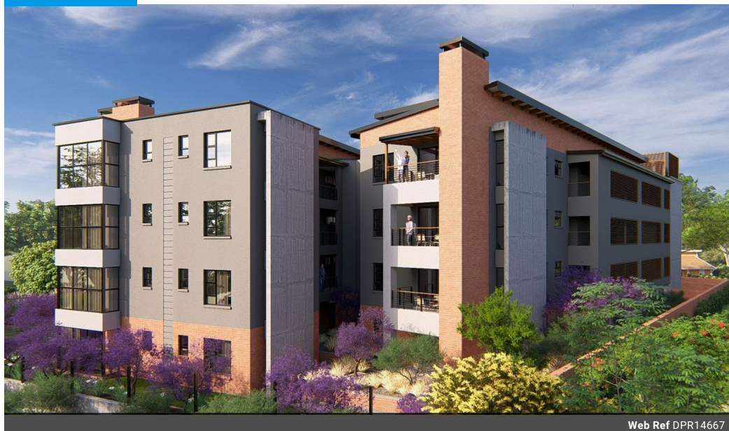
Web Ref DPR14667