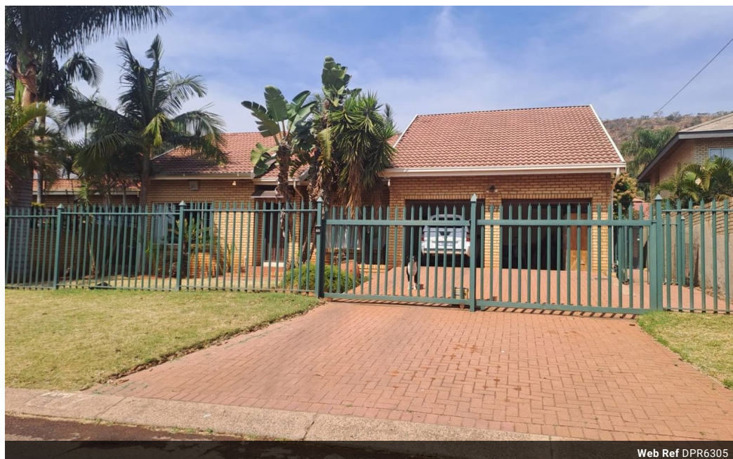
Web Ref DPR6305