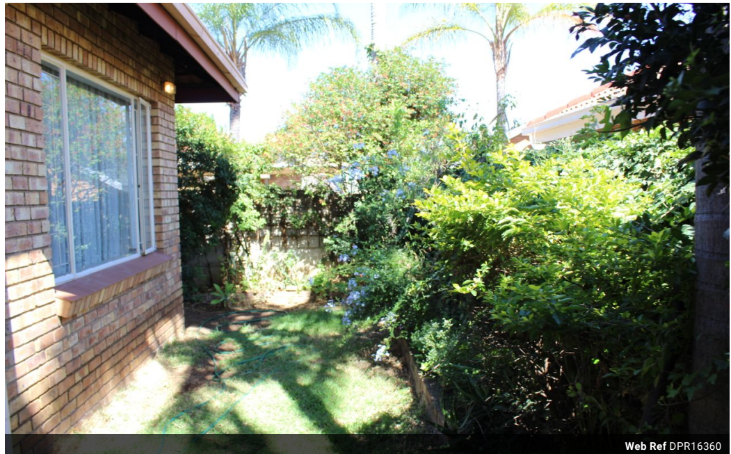
Web Ref DPR16360