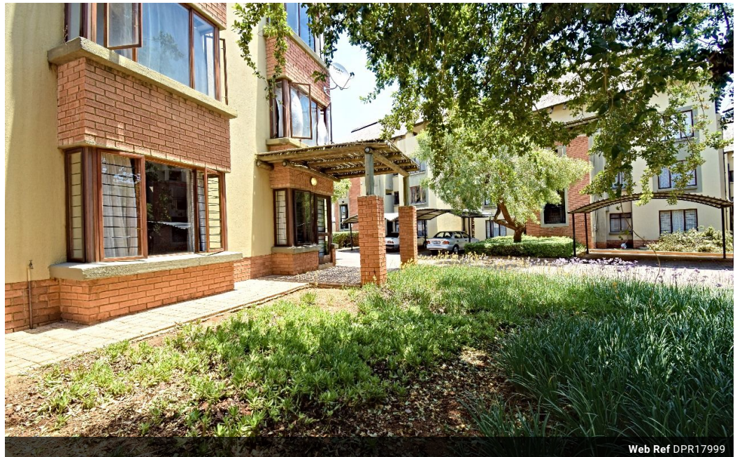
Web Ref DPR17999