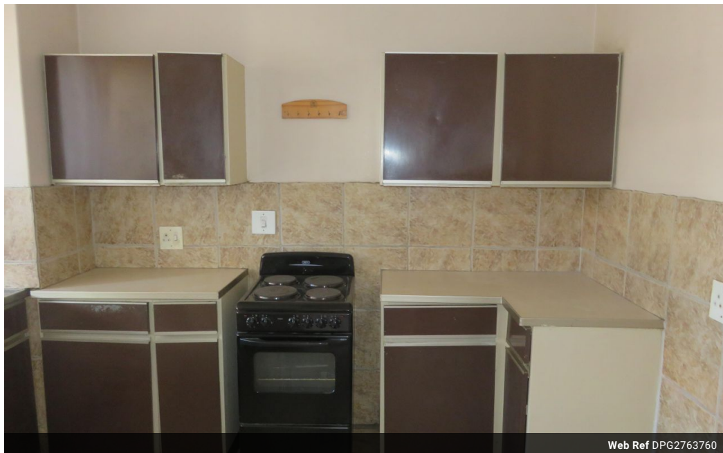
Web Ref DPG2763760