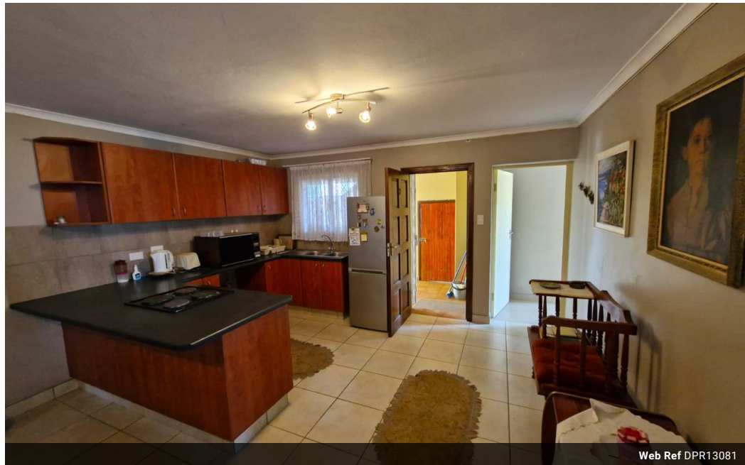
Web Ref DPR13081

Shop 2, 120 Stella Road Hillary Durban 4094