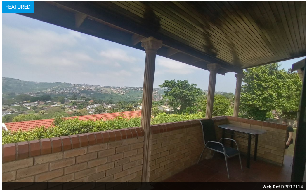
Web Ref DPR17114