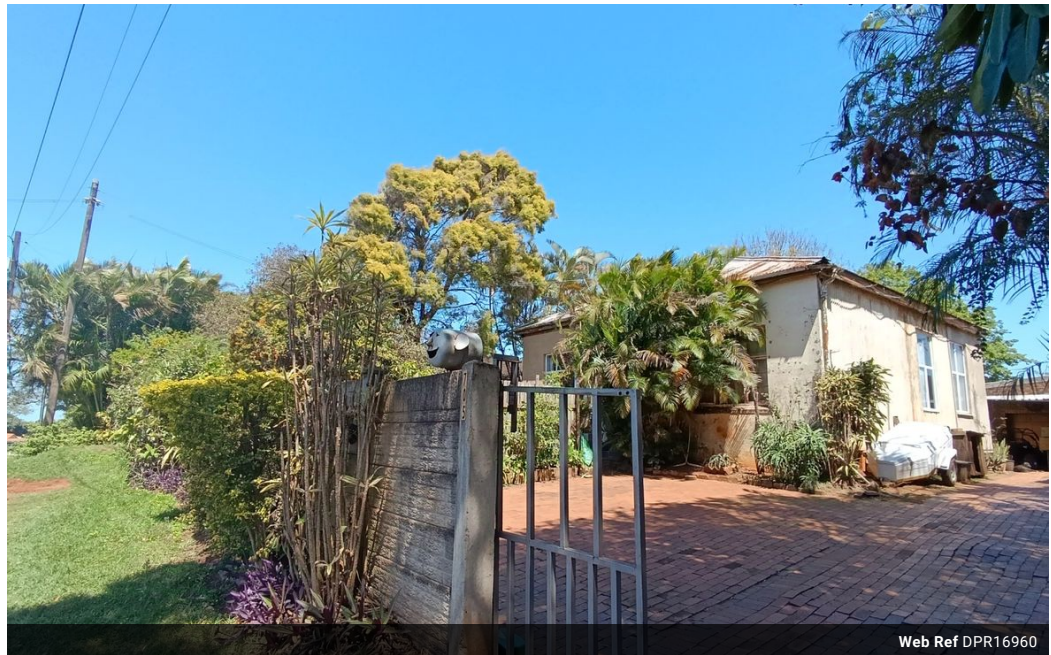
Web Ref DPR16960

Shop 2, 120 Stella Road Hillary Durban 4094