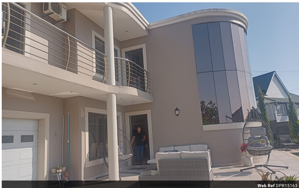
Web Ref DPR15163

Shop 2, 120 Stella Road Hillary Durban 4094