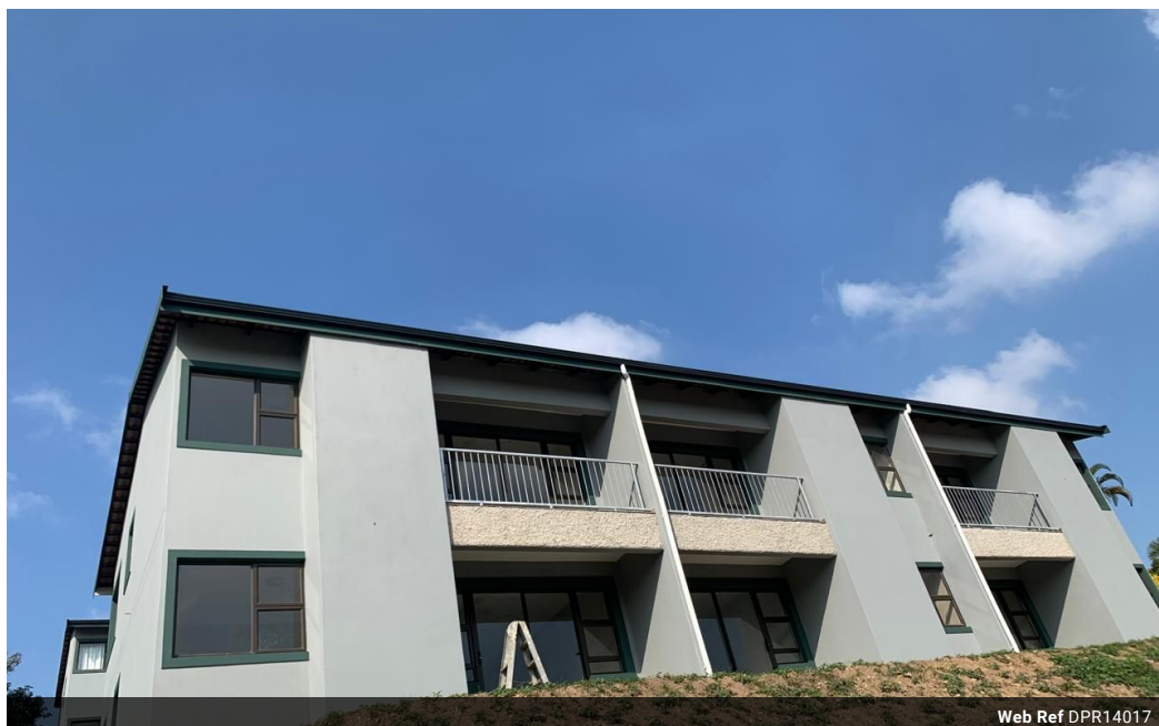
Web Ref DPR14017

Shop 2, 120 Stella Road Hillary Durban 4094