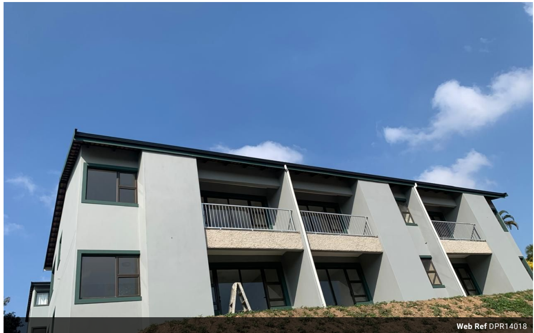
Web Ref DPR14018

Shop 2, 120 Stella Road Hillary Durban 4094