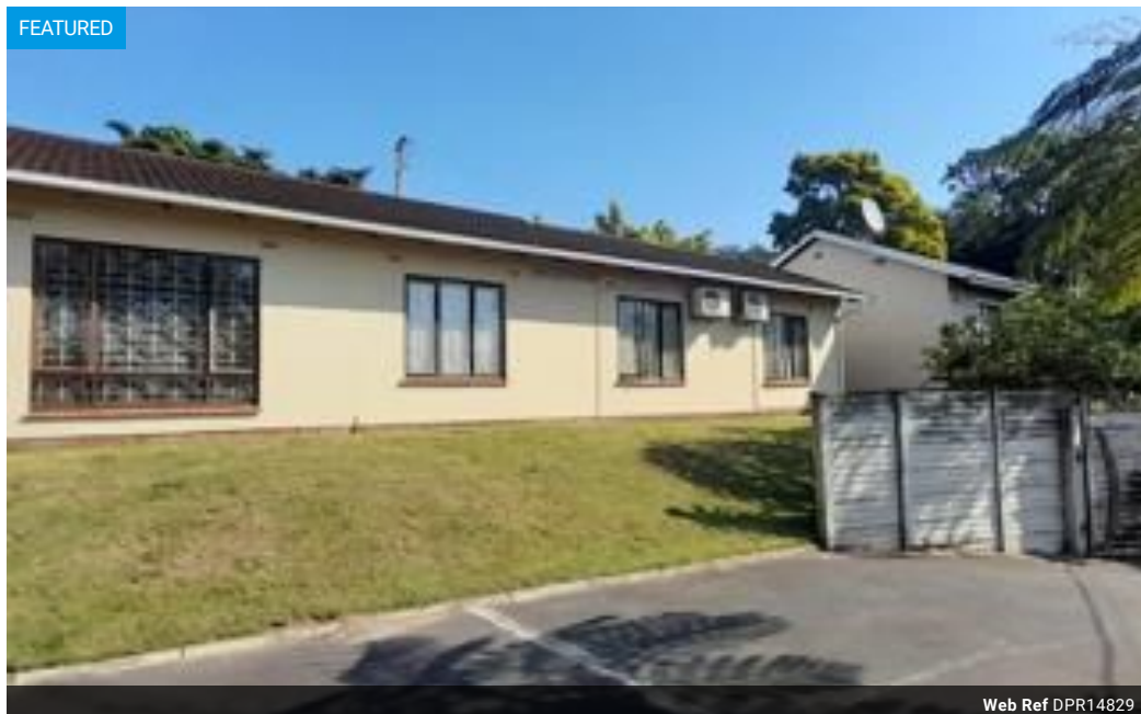
Web Ref DPR14829