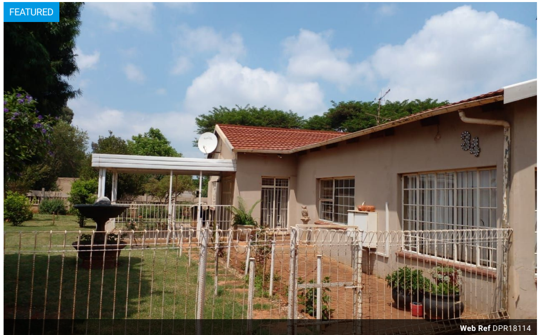
Web Ref DPR18114