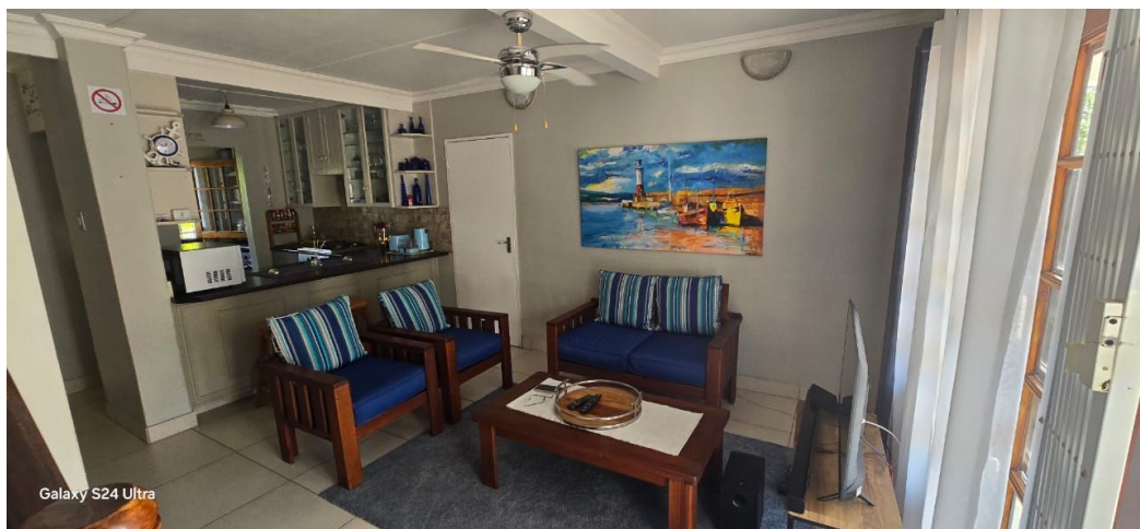
Galaxy S24 Ultra