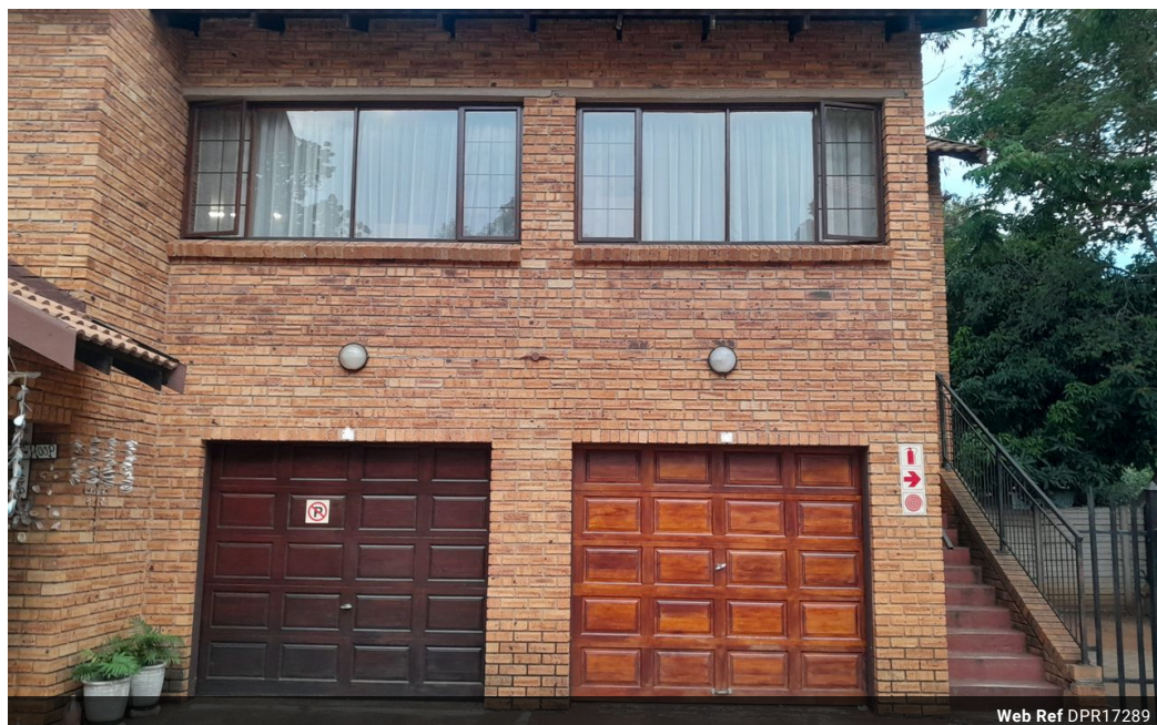
Web Ref DPR17289

Mystic Blue Office Park 220 Beyers Naude Drive Rustenburg 0229