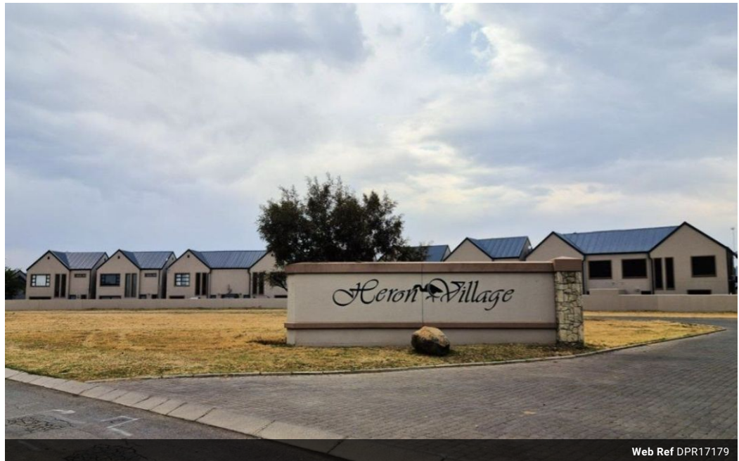
Web Ref DPR17179

Shop 2, The Palms Shopping Center, Louis Trichardt Blvd, Vanderbijlpark, 1911