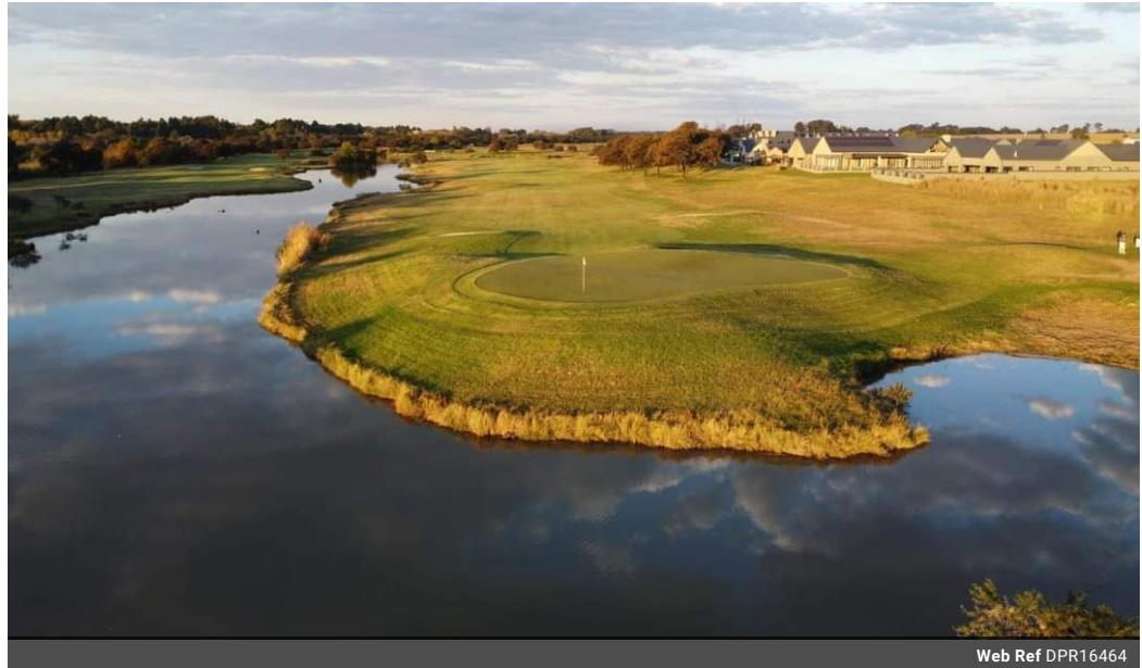
Web Ref DPR16464

Shop 2, The Palms Shopping Center, Louis Trichardt Blvd, Vanderbijlpark, 1911