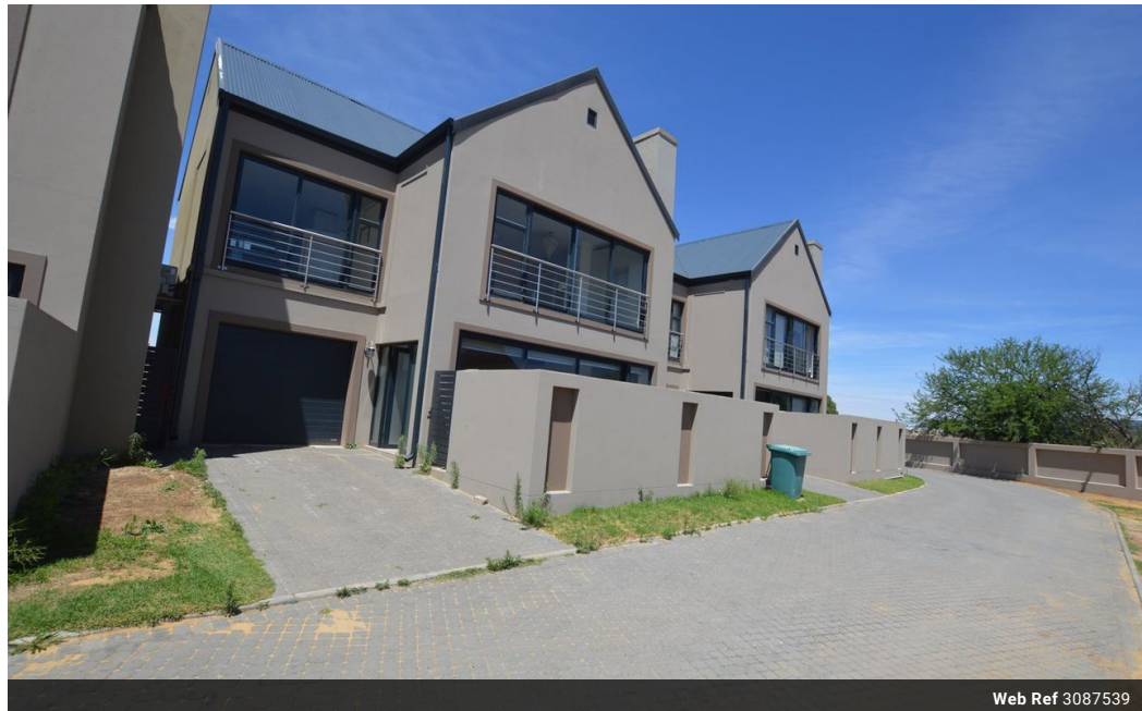
Web Ref 3087539

18 Klip River Drive, Three Rivers, Vereeniging