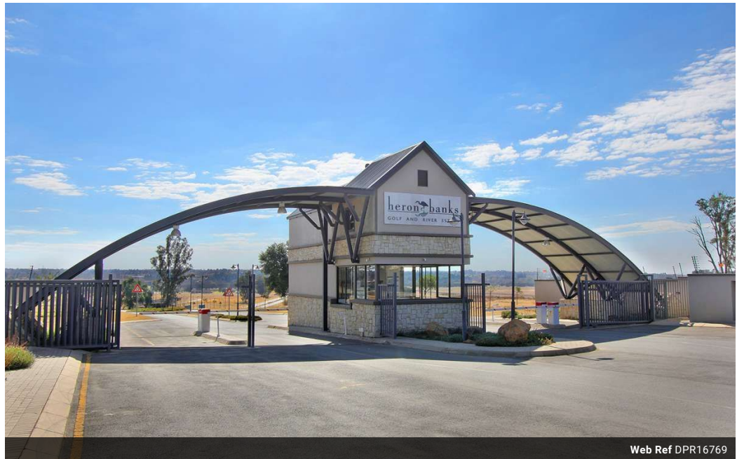
Web Ref DPR16769

Shop 2, The Palms Shopping Center, Louis Trichardt Blvd, Vanderbijlpark, 1911