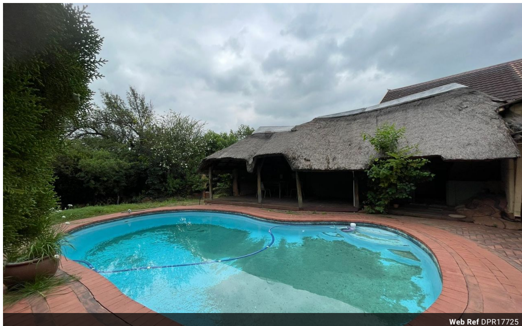
Web Ref DPR17725

Shop 2, The Palms Shopping Center, Louis Trichardt Blvd, Vanderbijlpark, 1911