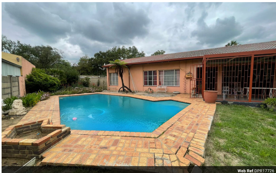
Web Ref DPR17726

Shop 2, The Palms Shopping Center, Louis Trichardt Blvd, Vanderbijlpark, 1911