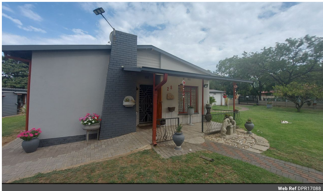
Web Ref DPR17088

Shop 2, The Palms Shopping Center, Louis Trichardt Blvd, Vanderbijlpark, 1911