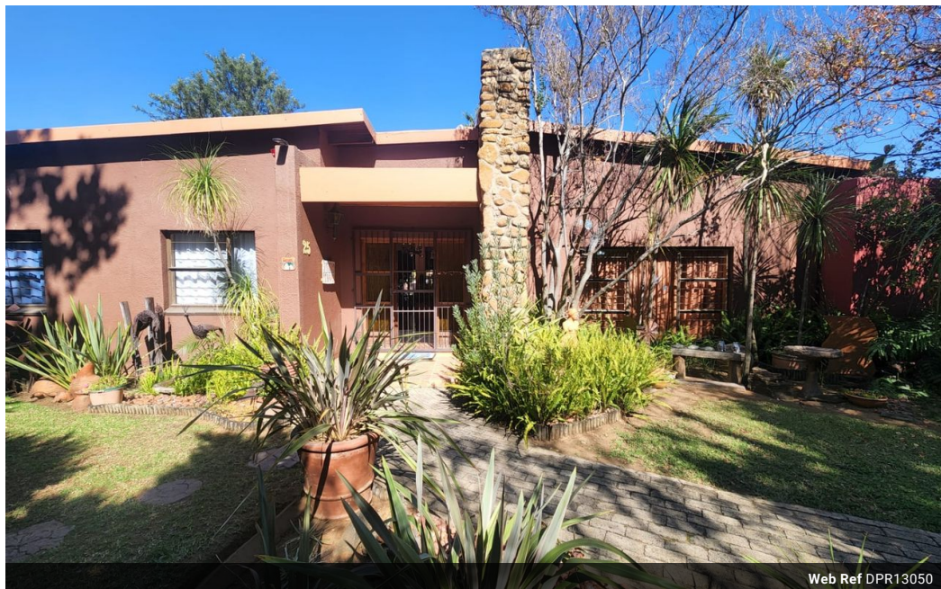
Web Ref DPR13050

Shop 2, The Palms Shopping Center, Louis Trichardt Blvd, Vanderbijlpark, 1911