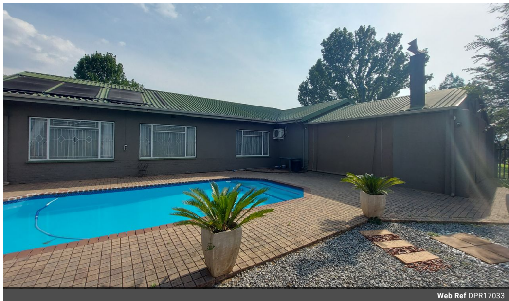
Web Ref DPR17033

Shop 2, The Palms Shopping Center, Louis Trichardt Blvd, Vanderbijlpark, 1911